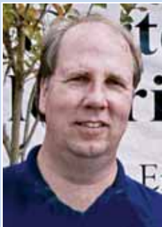
Ben Ball Foundation president

The goal of the foundation is to “assist and empower individuals with resources provided through the generosity of the cooperative’s members.”