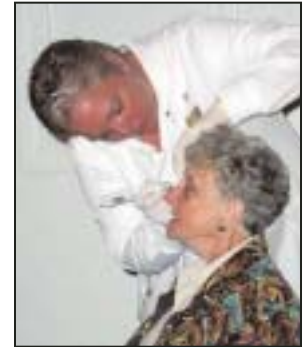
Glaucoma screenings will be available again this year.

The annual meeting also is an opportunity for you to enjoy entertainment by some of the areas most talented young people. This year's entertainment will be provided by jazz bands from Morehead City Middle School and Croatan High School, as well as the Havelock High School Chorus. You will get to meet and help us honor our 2004 college scholarship winners, and you will see a moving video on the often-difficult and dangerous work performed by the cooperative's linemen.