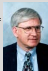
Arland Bell District #3