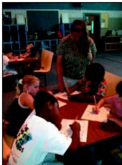
Students from the Boys & Girls Club do homework during afterschool program.

Information concerning OPERATION ROUND-UP ® can be found on our web site at www.ccemc.com under the Community section.