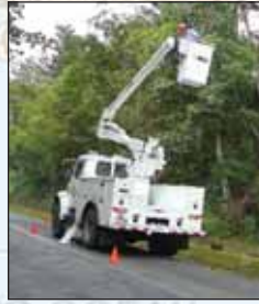
A retired CCEC bucket truck is used in the field by “sister” co-op Cooperativa Eléctrica del los Santos in Costa Rica.

The NRECA International Foundation partners with U.S. electric cooperatives and others to strengthen existing local co-ops, electrify rural villages and foster economic development, improving the lives of people in developing countries.